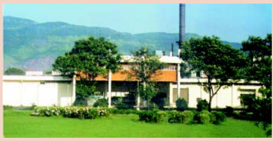
Radiopharmaceutical laboratory, BRIT, Vashi, Navi Mumbai.

Each vial contains 12 mg of sodium pyrophosphate, 4 mg of stannous chloride dihydrate and 1 mg of acorbic acid in freeze-dried form.