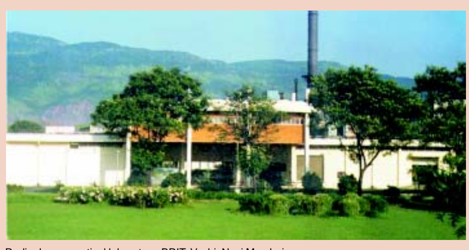
Radiopharmaceutical laboratory, BRIT, Vashi, Navi Mumbai.

Each vial contains 35mg of DTPA and 2mg of stannous chloride dihydrate (SnCl<sub>2</sub>·2H<sub>2</sub>O) in freeze-dried form.