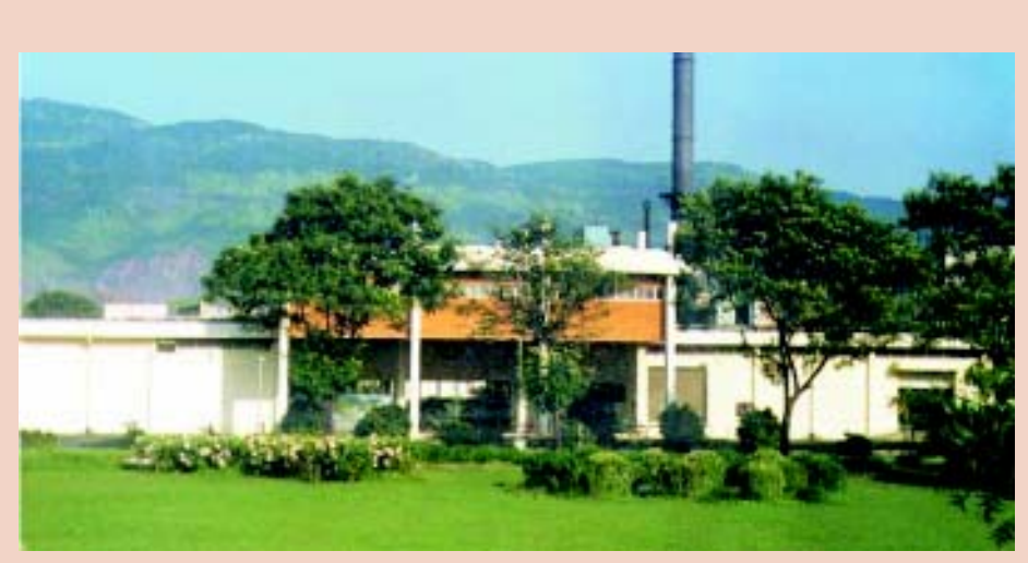
Radiopharmaceutical laboratory, BRIT, Vashi, Navi Mumbai.

Component - B : 35 mg of NaHCO<sub>3</sub> in freeze - dried form.